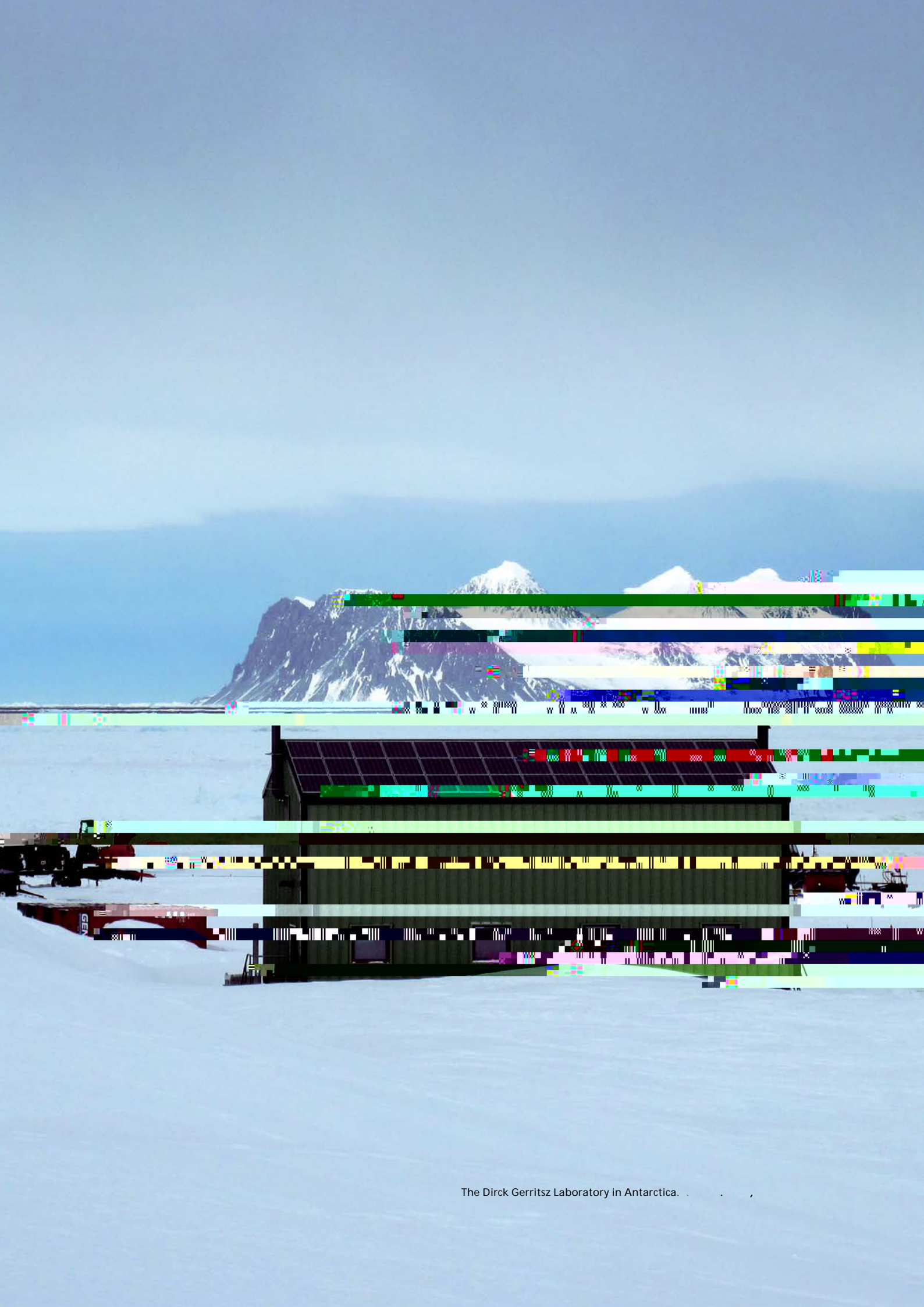
The Dirck Gerritsz Laboratory in Antarctica. . . . .